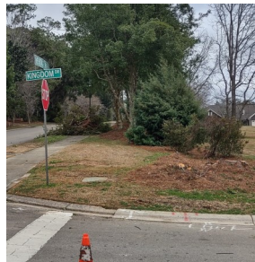
Corner of Landings Loop and Kingdom—before and after

Heritage Park Boulevard landscaping project — On February 17, Arbor Pros removed some wax myrtles, camphor trees and cypress trees, as well as some other invasive trees/shrubs along Heritage Park Boulevard. Hurst Outdoor Services has begun planting replacements for these and temporary irrigation has been installed to support these new plants until they are established. Plantings include cypress, redbud, fringe trees, vitex, firebush, agapanthus, witch hazel, muhly grass and more. If you haven’t driven down that way lately, check it out. This area was heavily damaged by a couple of hurricanes and badly needed a facelift. A big thank you to the Board members who worked on this project!