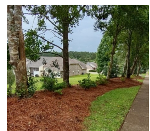
New trees and landscape plants along Heritage Park Boulevard

The Piney-Z Homeowners Association (HOA) is a Florida non-profit corporation formed in 1997. All Piney-Z homeowners are members of the HOA. The five members of the HOA Board of Directors are volunteer homeowners who are elected by the HOA membership and serve staggered two-year terms. Board members are elected at the HOA Annual Meeting held in July .