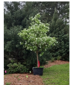
Fringe tree in bloom